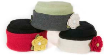
Hat with Flower -FM

wool - cashmere - unlined s/m or m/l $24