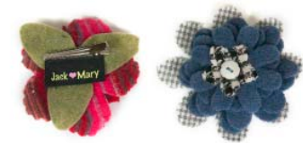
Flower Pin -FP

wool - cashmere - alligator clip 4 x 4 $6