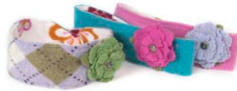
Headband with Flower -HBF

wool - cashmere - fleece lined adjustable $20