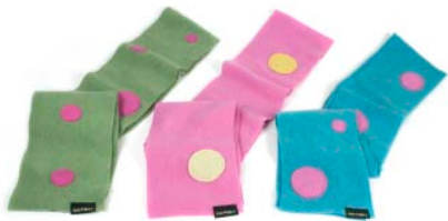
Scarf with Dots -SD

wool - cashmere - fleece lined adjustable $14